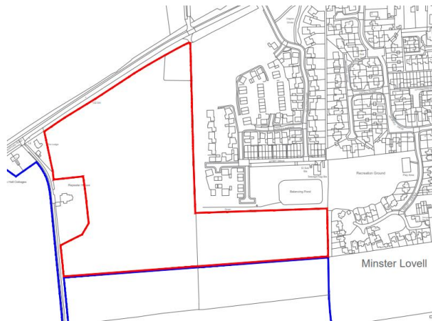
Correct site area.