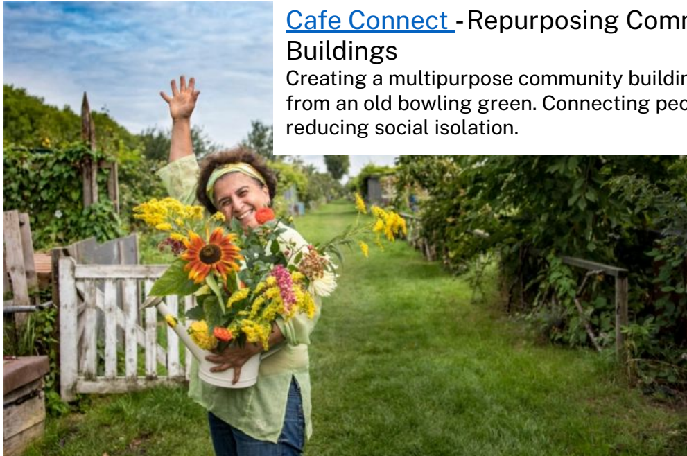
Cafe Connect - Repurposing Community Buildings Creating a multipurpose community building & cafe from an old bowling green. Connecting people & reducing social isolation.