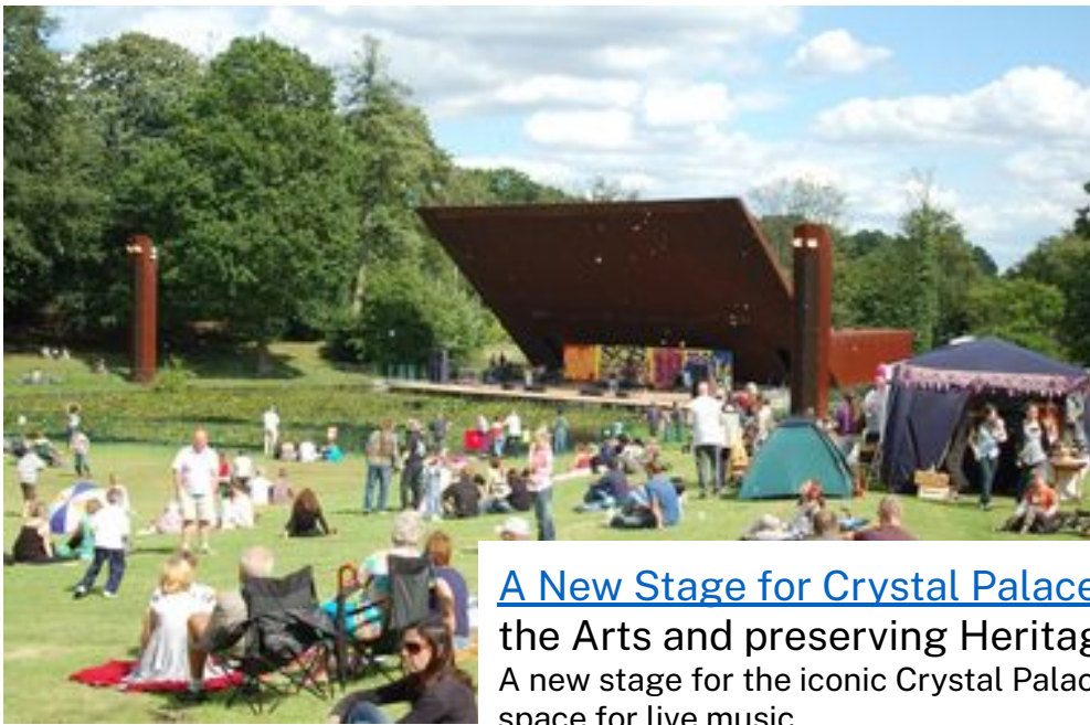
A New Stage for Crystal Palace Bowl - Promoting the Arts and preserving Heritage A new stage for the iconic Crystal Palace Bowl. A community space for live music