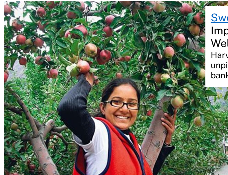
Sweet Pickings - Improving Health & Wellbeing Harvesting fresh fruit from unpicked trees to give to food banks in the community