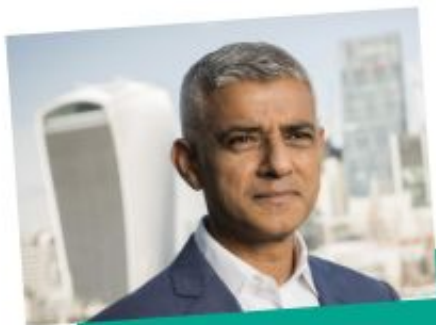
Sadiq Khan Mayor of London

"Our partnership puts communities in the driving seat of change and gives many more people, groups and companies the opportunity to shape their city."